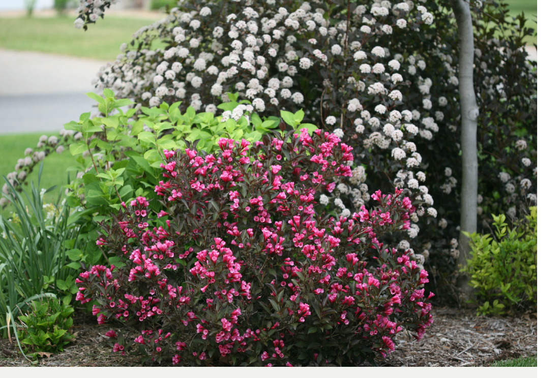
Featured: Wine and Roses Weigela and Summer Wine Ninebark