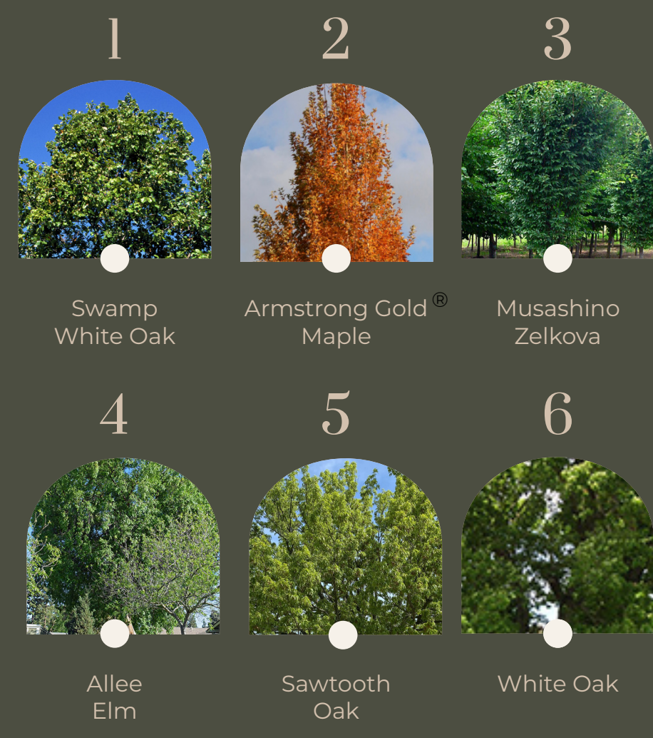
Visit our tree experts for help finding the perfect tree!

Want to add shade to your garden or patio? Here are 6 stunning stately favorites!