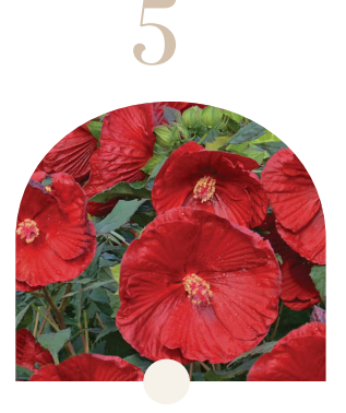
Summerific® Cranberry Crush Hibiscus