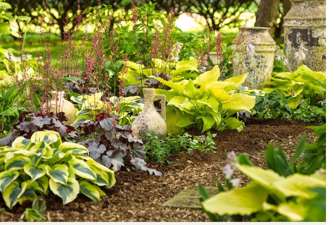
Featured: Shadowland Autumn Frost and Coast to Coast