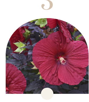
Summerific® Holy Grail Hibiscus